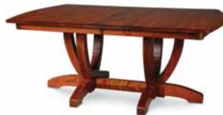
Shown with: Empire, Brookfield Pedestal