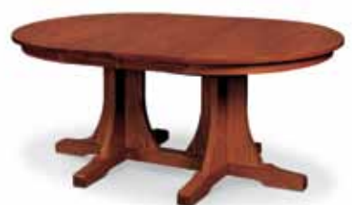
Shown with: Oval, Prairie Mission Pedestal