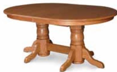
Shown with: Oval, Traditional

Build your own double pedestal table to order. The double pedestal table offers one of the most unique looks available for the dining room or kitchen. Using the examples shown here for inspiration, begin creating your own double pedestal table design.