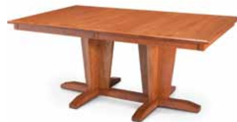
Shown with: Rectangle w/ no Corner Radius, Brooklyn Pedestal